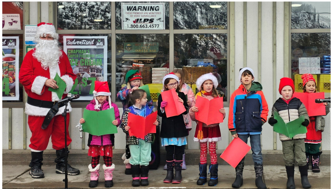
Carolers at Fill the van event at Belich's. Great job!!