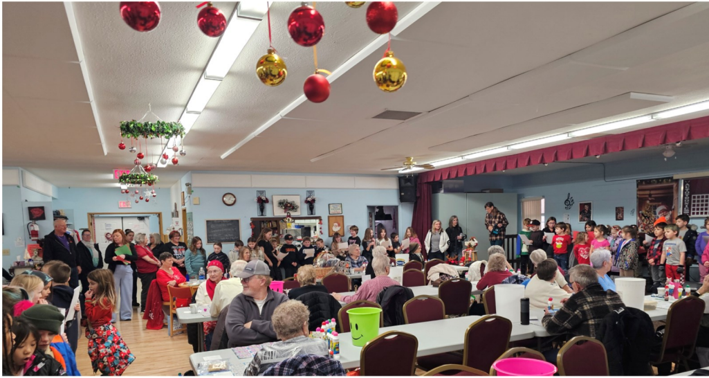
Carols at the Senior center.